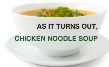
AS IT TURNS OUT, CHICKEN NOODLE SOUP

As part of a program called "Operation Stop Cough," military recruits were told to wash their hands at least five times a day. After 2 years, the HAND-WASHING team reported 45% FEWER CASES of respiratory ailments than recruits from the year before, who did not participate in the program.