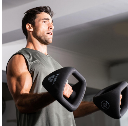
Center Grip = Dumbbell