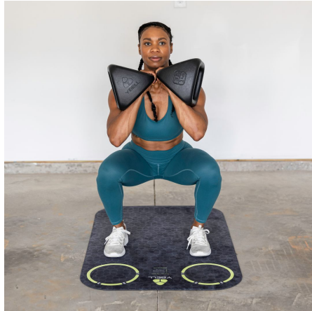
Outer Grip = Kettlebell