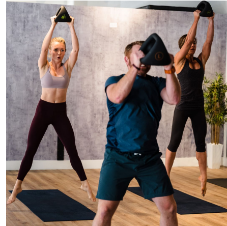
Double / Under Grip = Med Ball