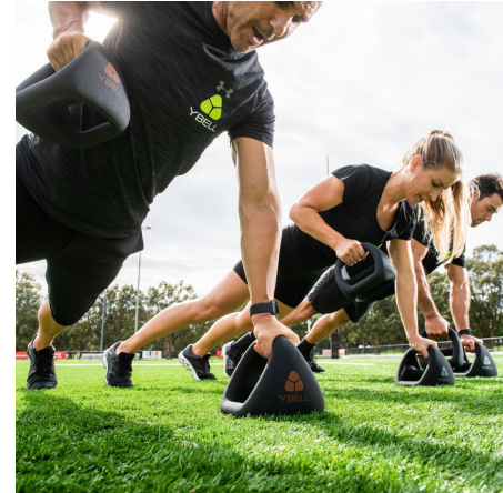
Top Grip = Push-Up Stand

By simply switching your grip of the YBell, the weight distribution shifts changing it from one piece of equipment to another.