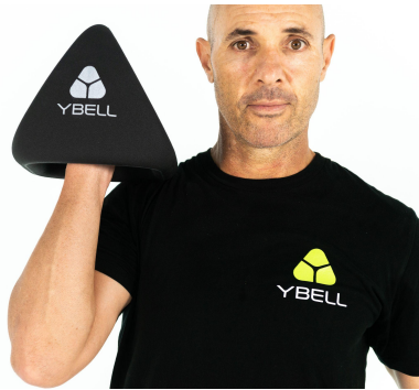
Center Grip - Loose Grip

Center Grip - Loose Grip is where Top Lock is released while still holding center handle. It is no longer touching wrist.